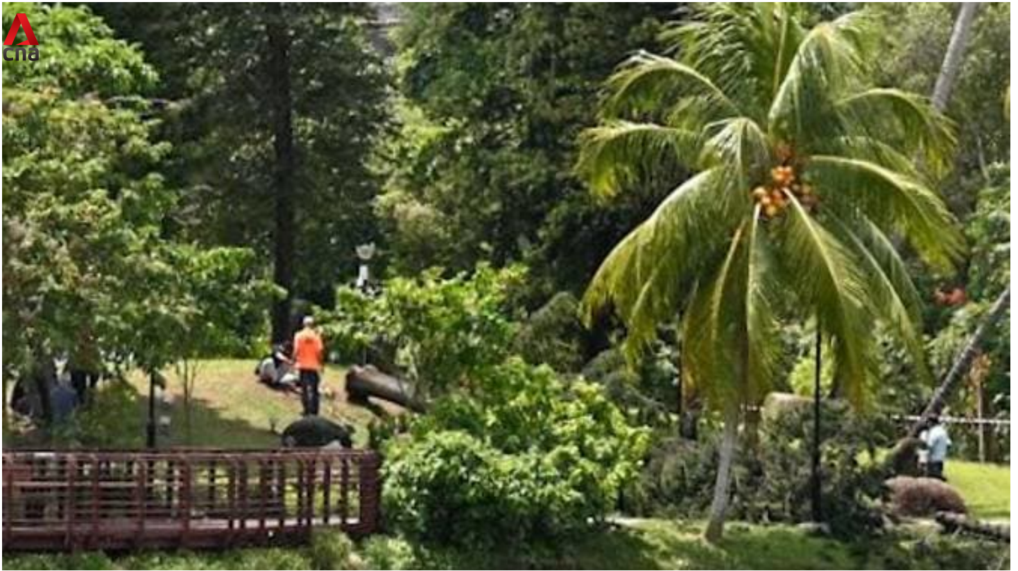
View of the scene of the incident at Marsiling Park on Feb 18, 2021.