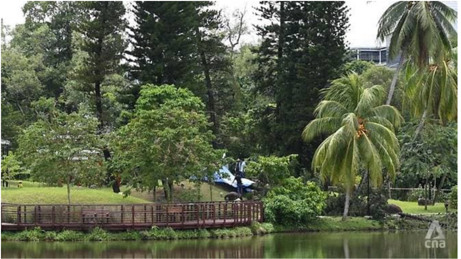
A cover is placed over the fallen tree at Marsiling Park, Feb 18, 2021.

A passer-by then began calling for help, said the teen, which is when he noticed a woman in exercise clothes trapped under the tree.